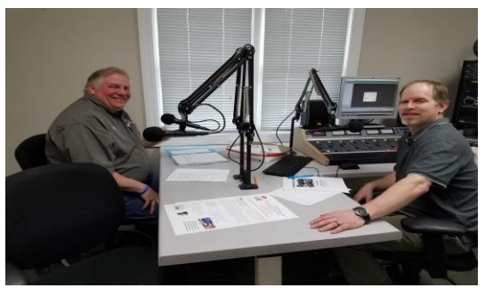
Sibley Talk on KGLB radio